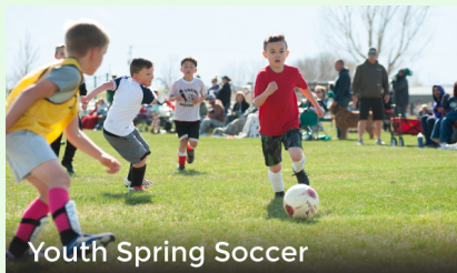
Youth Spring Soccer

Complete and return the city job application to the Tremonton City office. APPLY HERE!