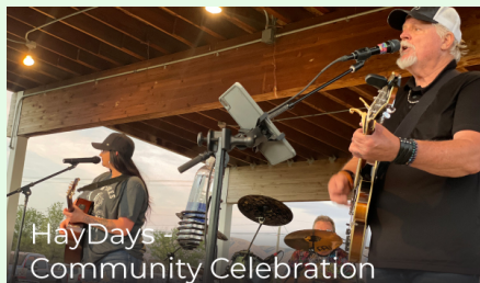
HayDays Community Celebration

We are looking for vendors of perishable goods. Vendors can apply to sell their goods HERE!