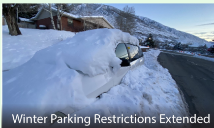
Winter Parking Restrictions Extended

Tremonton is a unique city focused on connections. We are connected with our rich heritage as a town founded by immigrants who created a welcoming, supportive community. We are connected in our vision of a bright future that remembers our roots, preserves our values, and grows with intelligence and intention without compromising what makes our city special. We are connected to each other through our small-town spirit where neighbors know and help one another and residents and city officials alike listen and collaborate. We are connected to the land and nature with beautiful outdoor surroundings, fun adventures, and agricultural ties. We are connected to all that our valley offers— meaningful work, quality education, entertainment, incredible outdoor adventure, and more—as well as the world at large with easy access to key highways and lightning-fast internet connection. Tremonton is a City of Connections, and it's what makes our town a gem of Northern Utah.