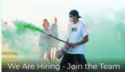
We Are Hiring - Join the Team

Make connections and build community. Tremonton Recreation is looking for sport minded enthusiasts looking to better the community to join their team. Help from the community is a necessity to offer and provide quality programs.