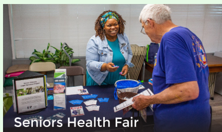
Seniors Health Fair

Karaoke is here! bring your friends and your best vocals to have some fun! We will have everything you need and you can choose whatever song you want to sing! We cant wait to see you there and hear your wonderful voices.