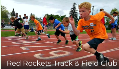
Red Rockets Track & Field Club

The skills taught will include jumping, throwing, sprinting, hurdles, and distance running. All participants will have an opportunity to compete. There will be competitive meets with other clubs around Northern Utah and District meets.